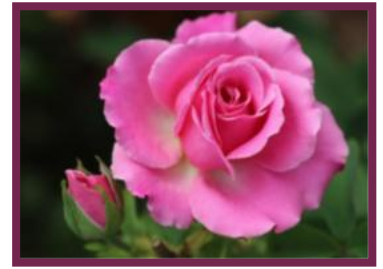
Signature Rose Best Friend