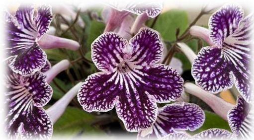
Streptocarpus Lady Slipper 'Grape Ice'

Although the common purple flowering varieties with the long tubular flowers are the hardiest. Many of the new cultivars are more colourful.