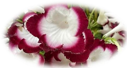
Streptocarpus Roulette Cherry

In cooler climates Streptocarpus are usually grown indoors, however, in warmer climates, sub-tropical to tropical, they can be grown outdoors, especially near the coast where temperatures at night do not drop so much.